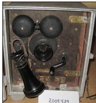
Field Telephone, ca. 1931

Once built, the Center will have dedicated repository space with environmental conditions suitable for preserving historical items. See page 8 for recent donations to the Collection.