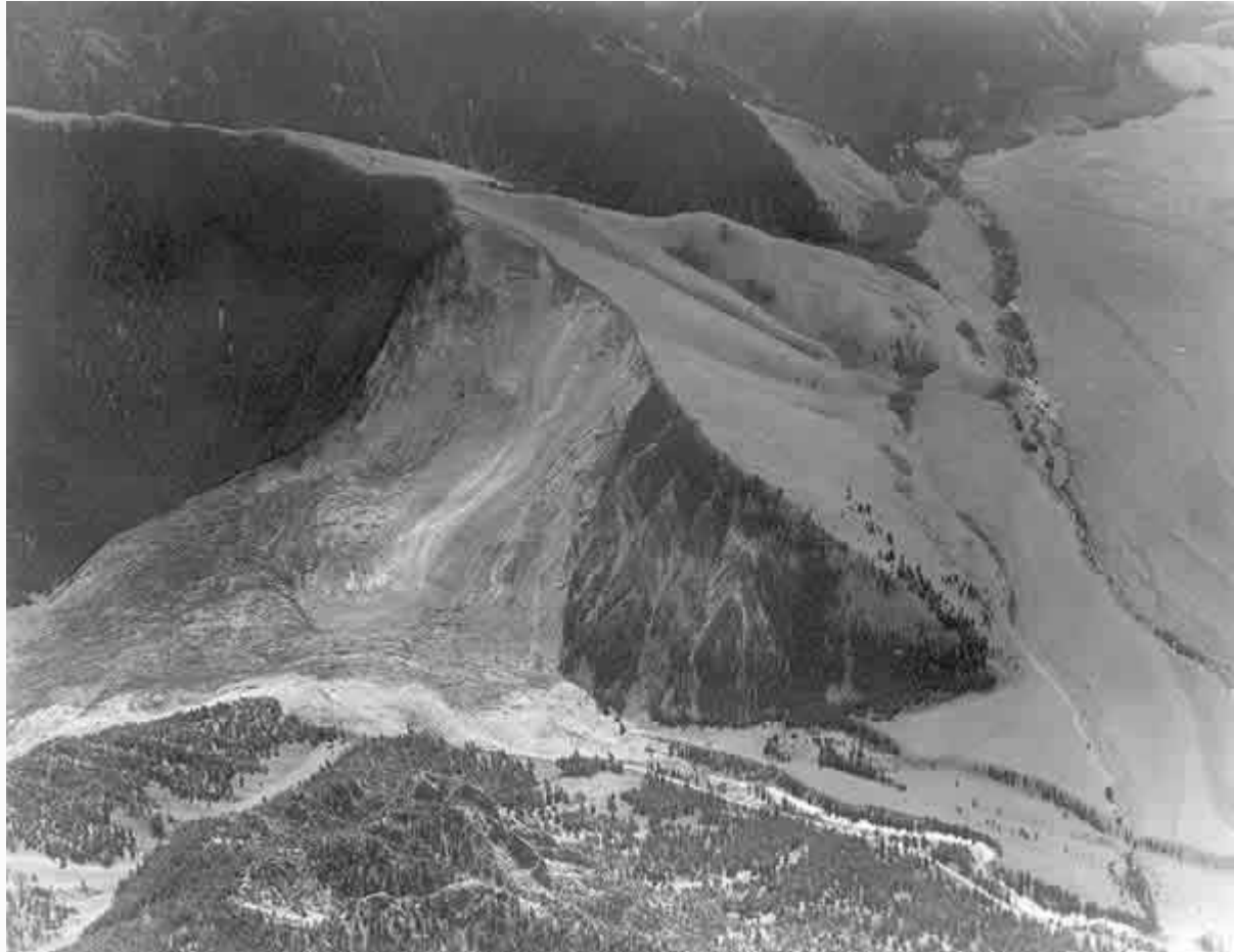
The August 17th, 1959, earthquake sent eighty million tons of mountain sliding from the southeast side of the canyon into the Madison River, shoving the water from its bed and killing twenty-eight people at a Forest Service campground.

From Montana The Magazine of Western History , 53 (Spring 2003), 65-66; this article is presented courtesy of the Montana Historical Society. All rights reserved, © 2002.